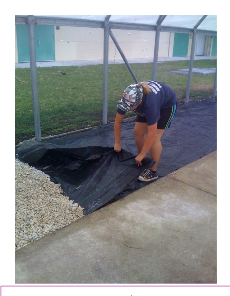
Laying out the tarp.