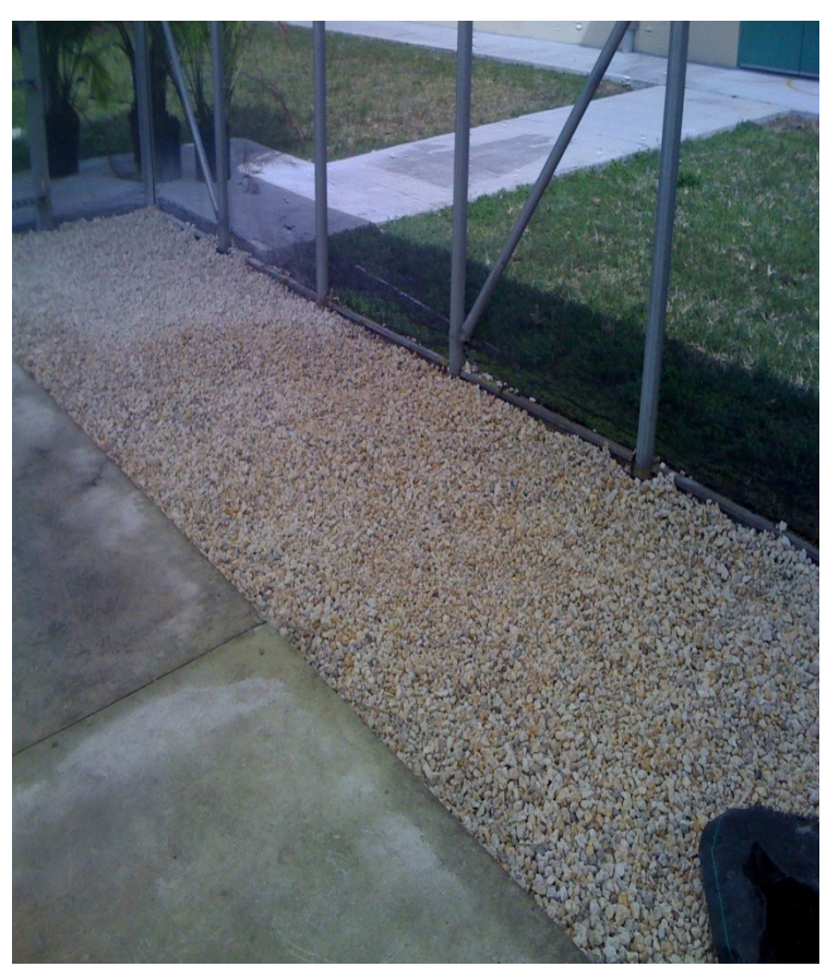
End of Day 1 (22 by 6 by .25 feet)