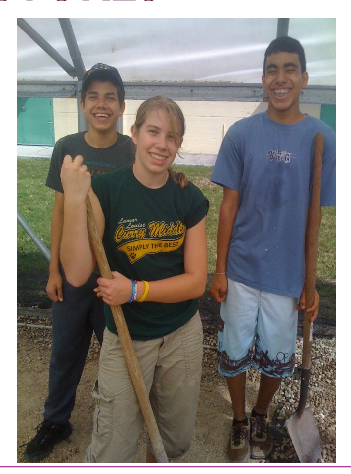
The gravel team.