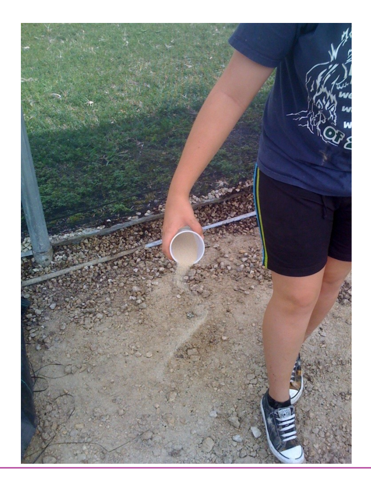
Spreading fire ant killer.