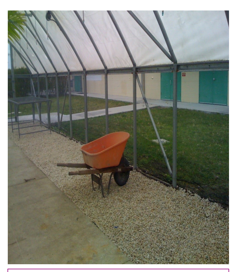
End of Day 2 (another 22 by 6 by .25 feet)