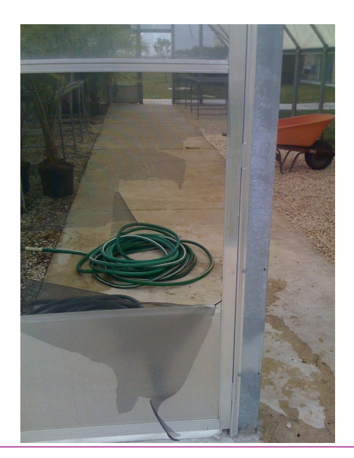
½ of the gravel has been done.