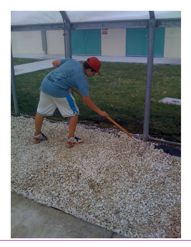
Raking the gravel into place.