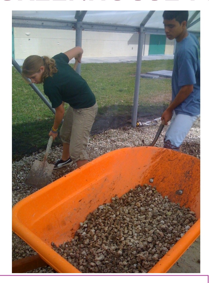
Hauling gravel to be bleached.