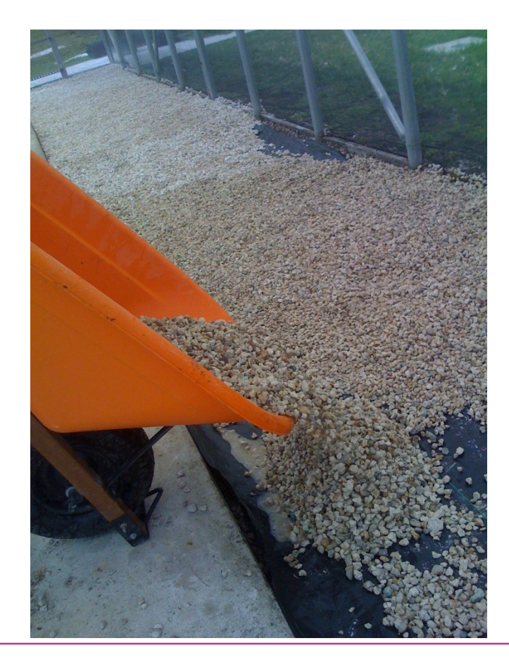
Dumping the clean gravel.