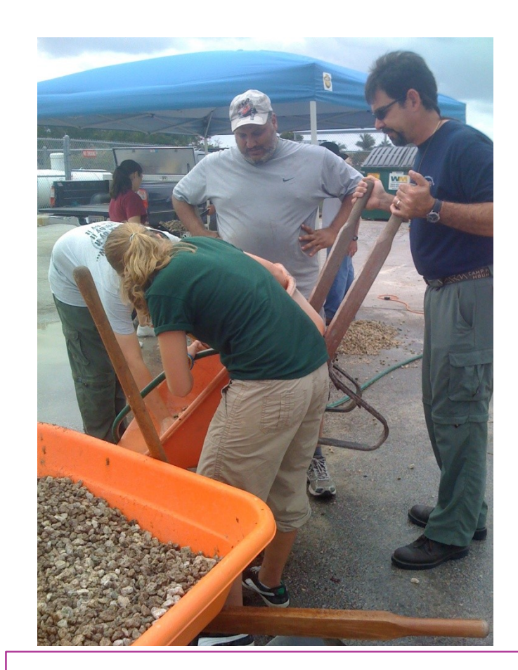
So begins the bleaching process.