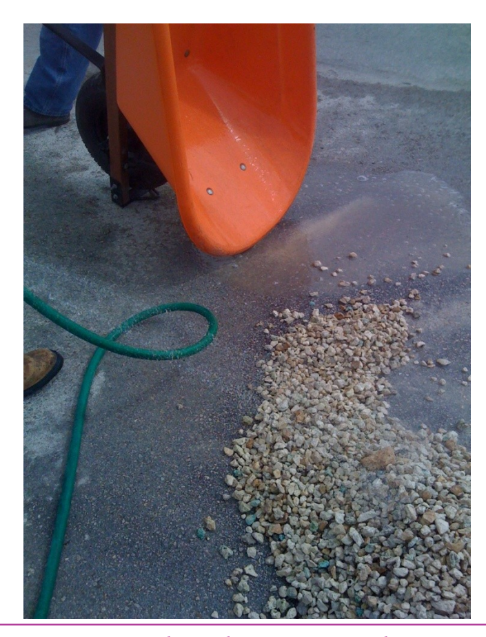
Dumping the dirty gravel into a new pile